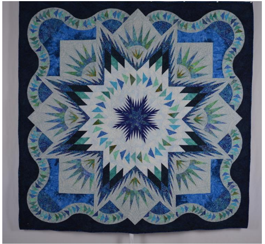
Glacier Star 60" x 60"