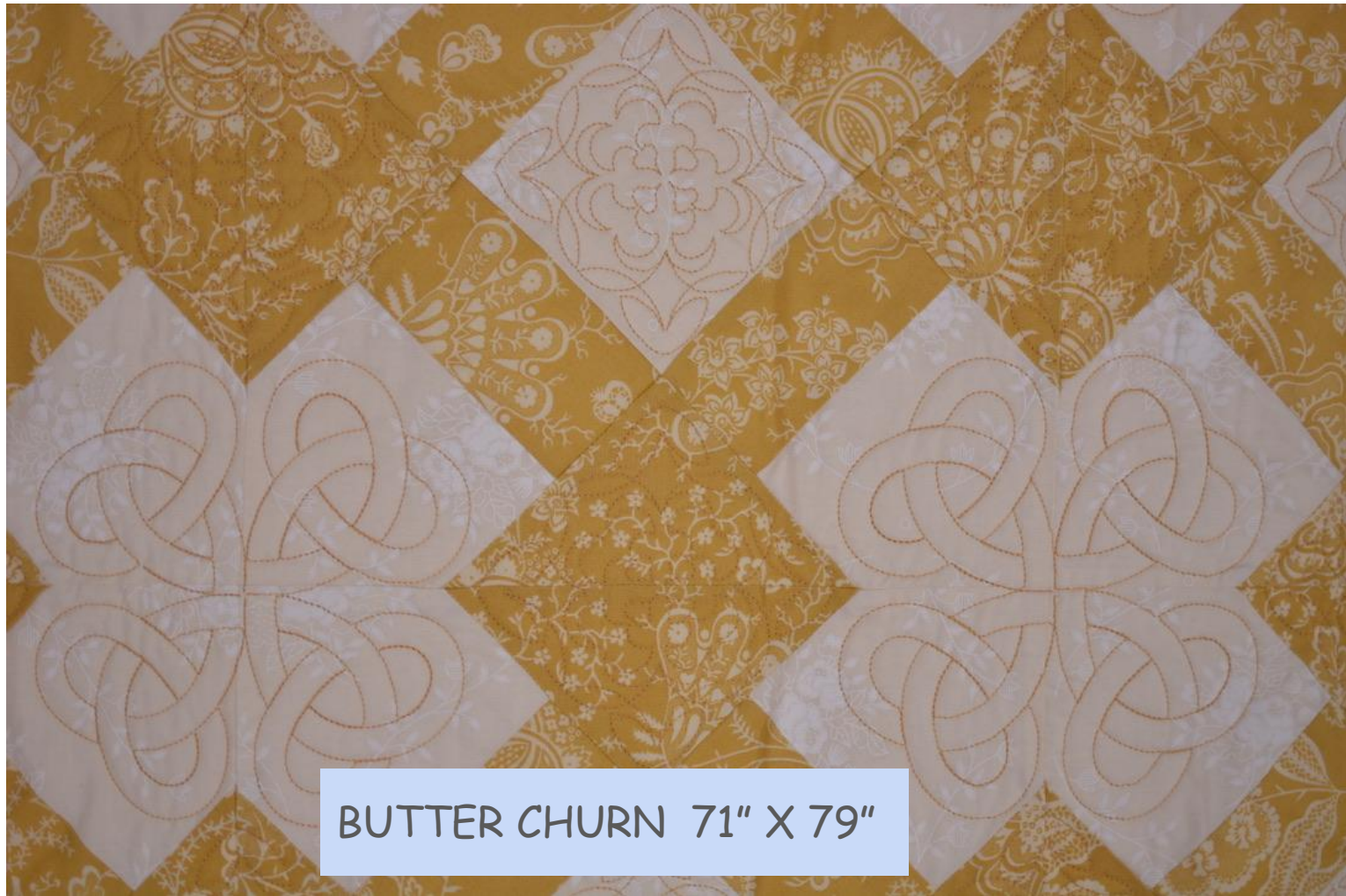
BUTTER CHURN 71" X 79"