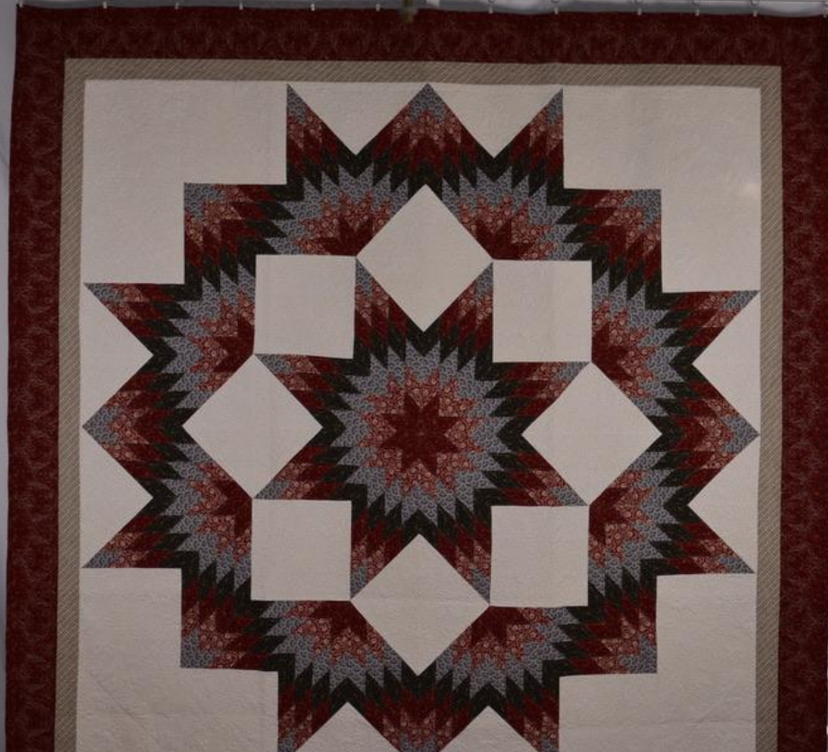
Broken Lone Star 92" x 92" Extra wide back