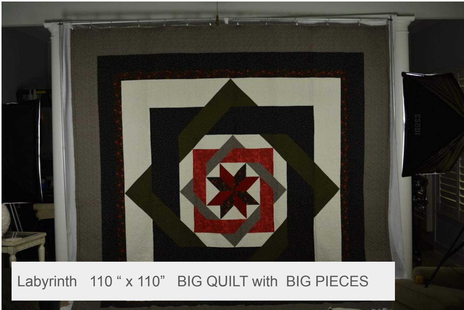
Labyrinth 110 " x 110" BIG QUILT with BIG PIECES