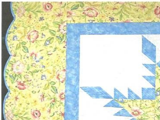
Bodacious Feathered Star